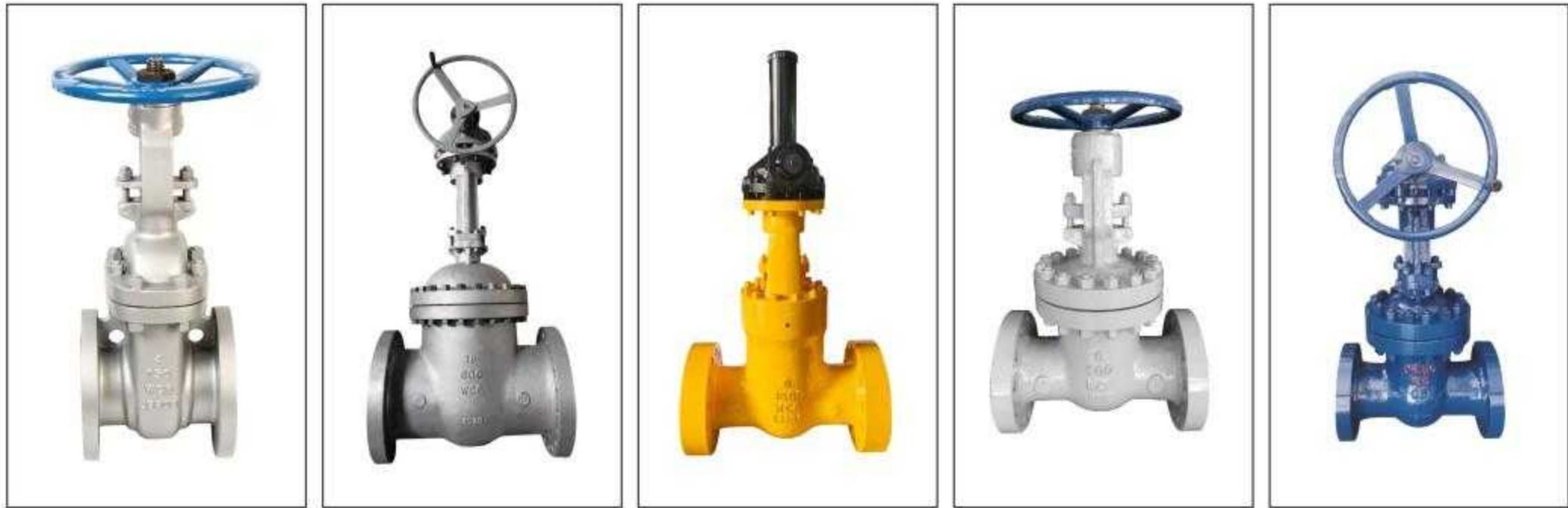
Gate Valve Series