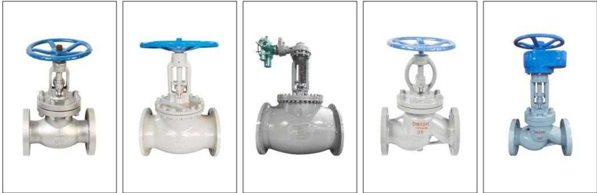
Globe Valve Series