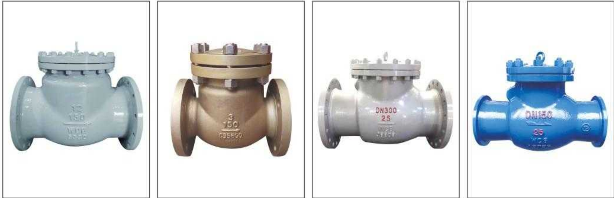
Check Valve Series