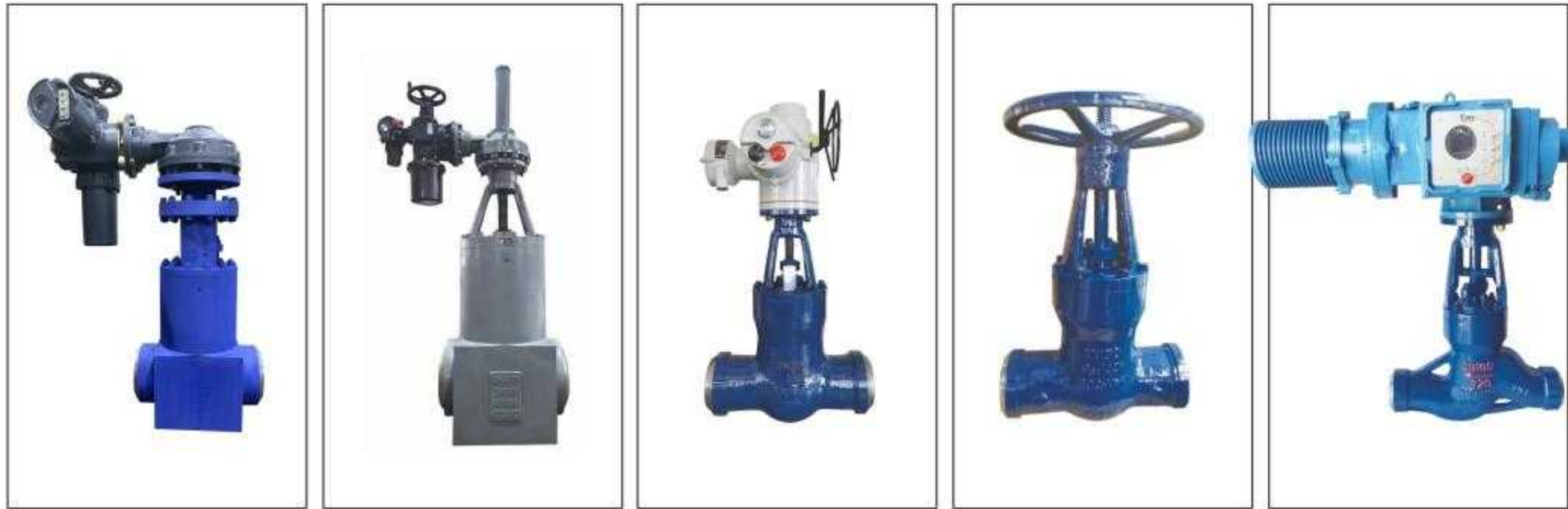
Power station/vacuum valve series