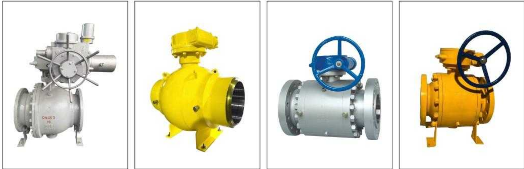
Ball valve series